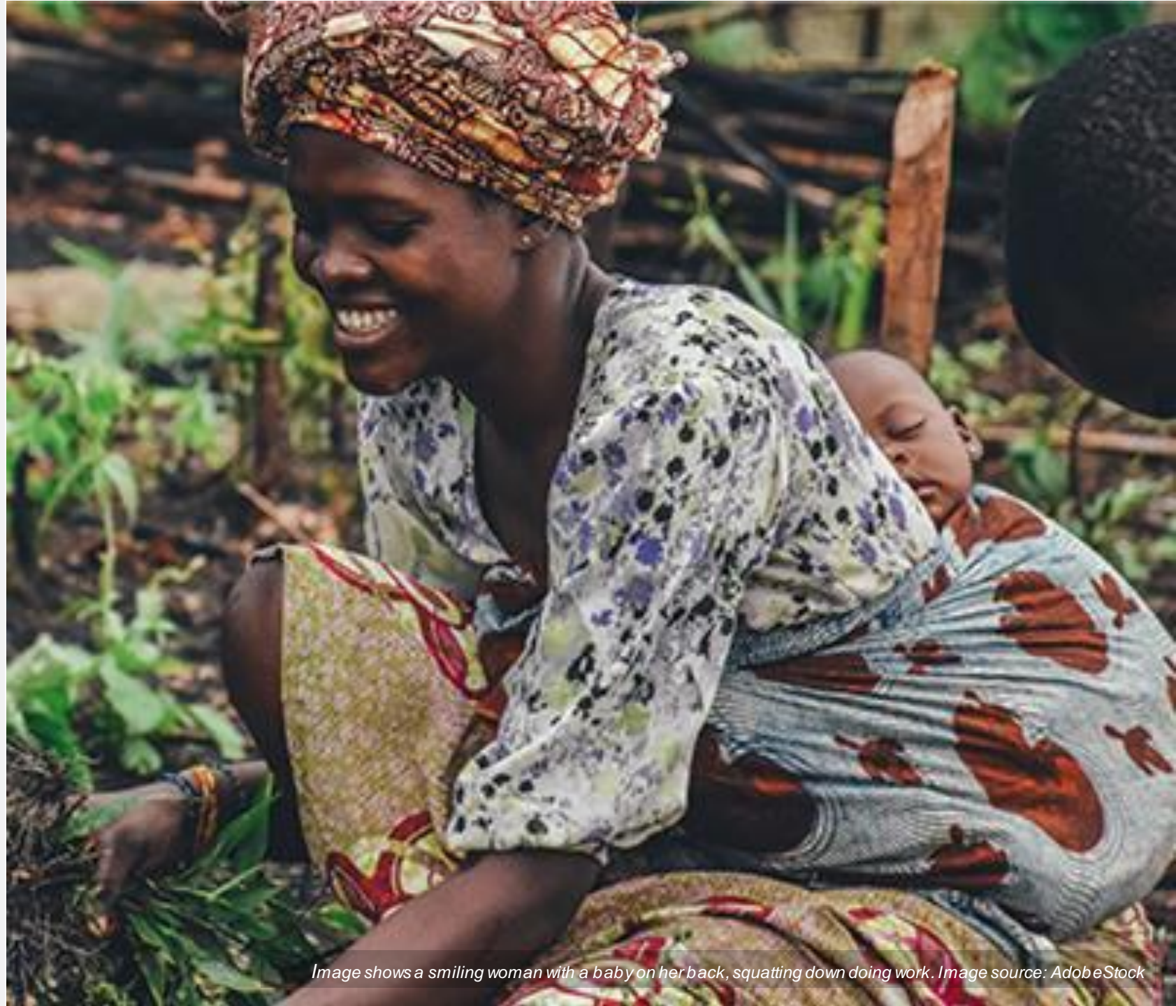
Image shows a smiling woman with a baby on her back, squatting down doing work.