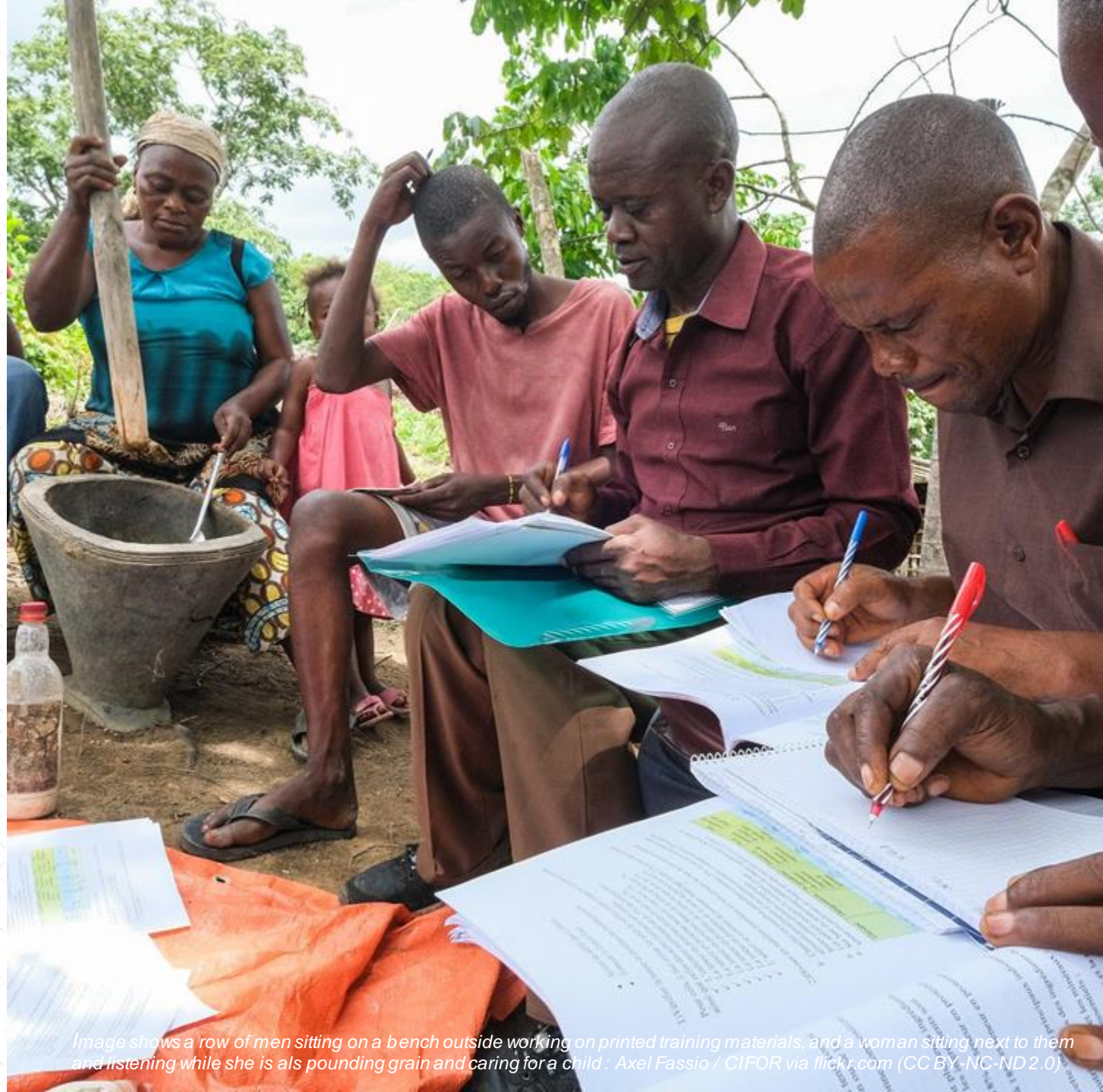
Image shows a row of men sitting on a bench outside working on printed training materials, and a woman sitting next to them and listening while she is also pounding grain and caring for a child

How much time do women allocate to productive and domestic tasks?