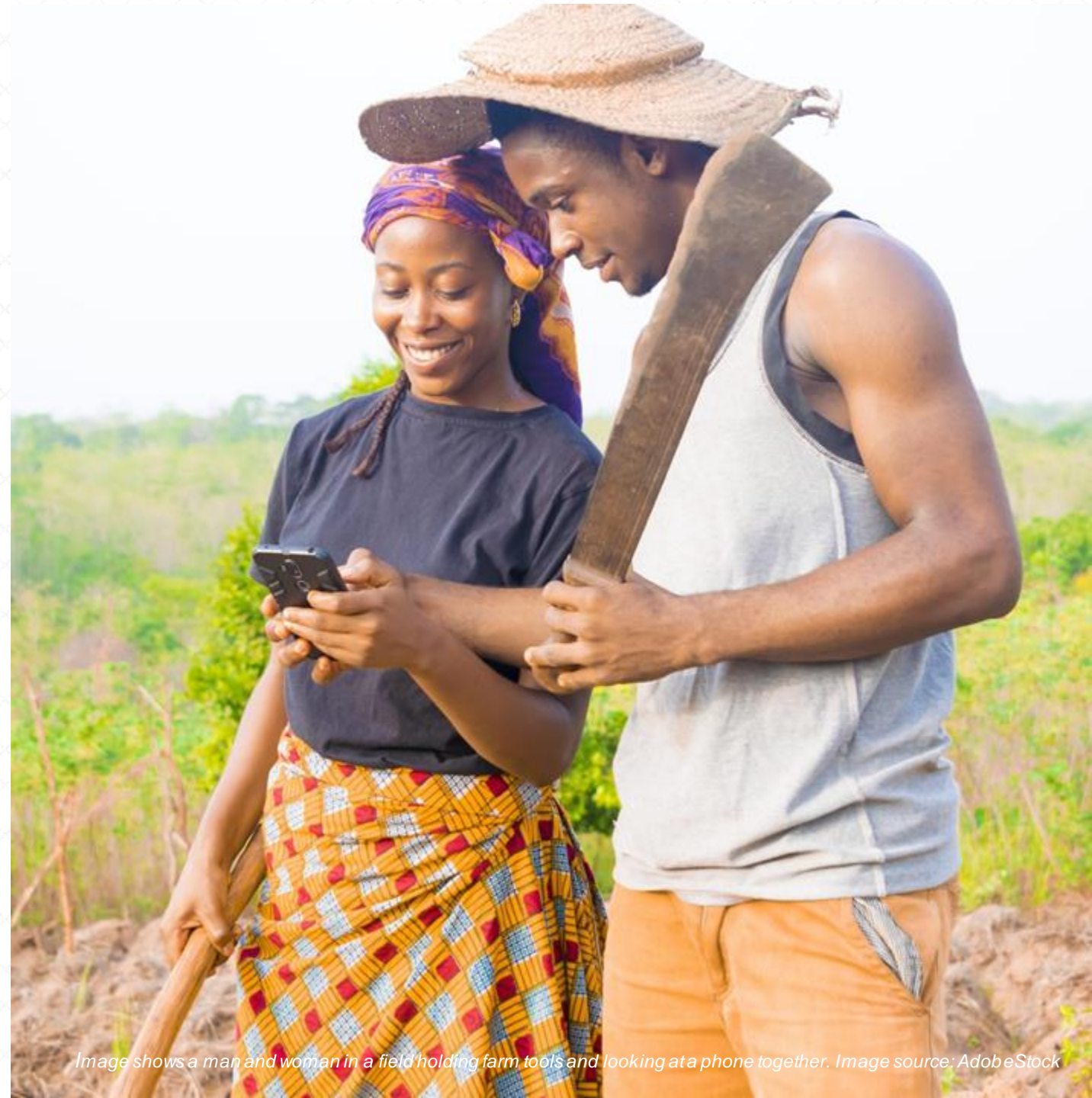
Image shows a man and woman in a field holding farm tools and looking at a phone together.

How much decision- making input do women have in agricultural production?