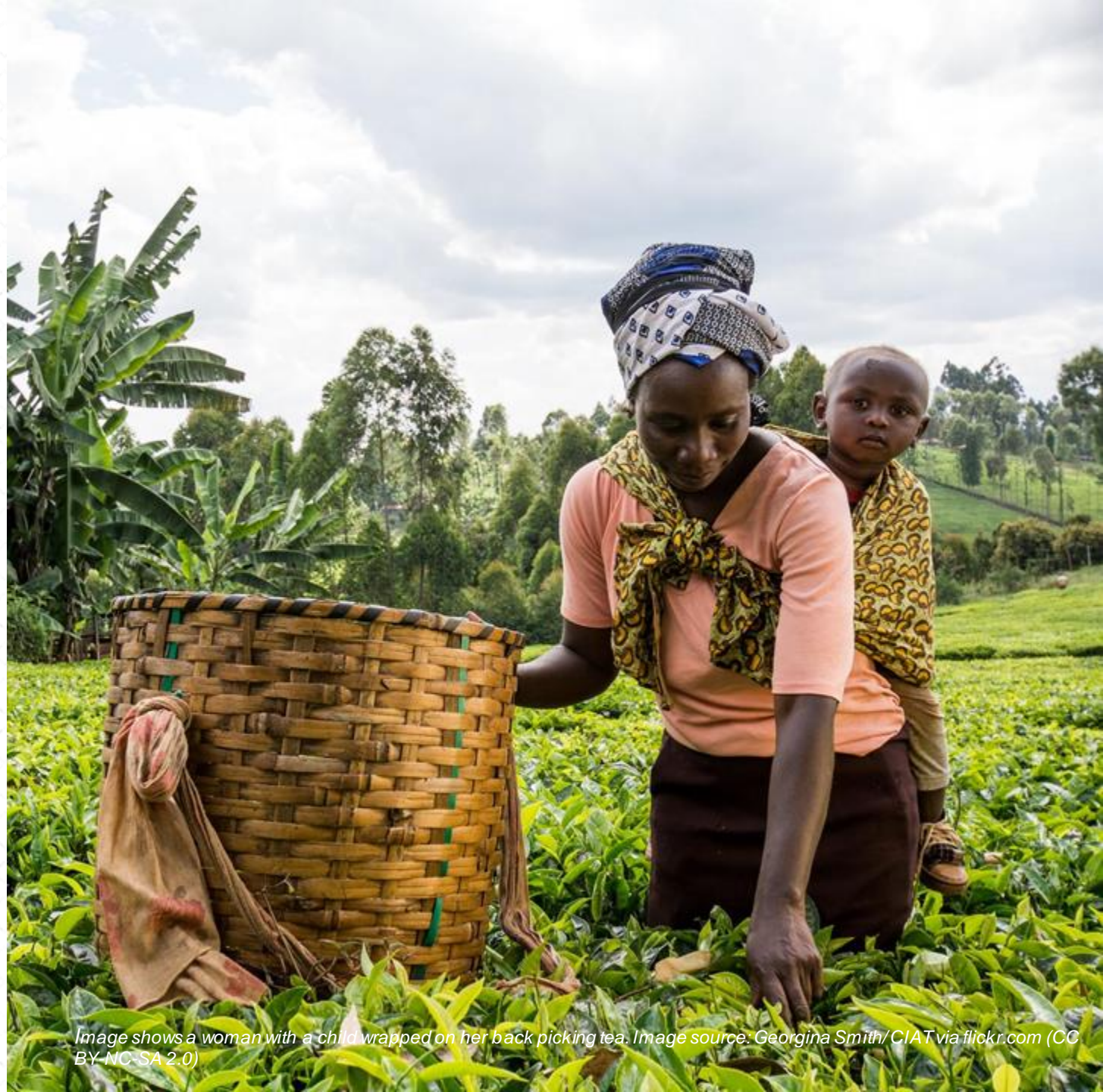
Image shows a woman with a child wrapped on her back picking tea.