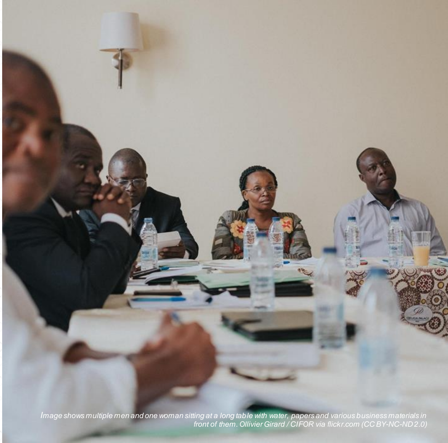
Image shows multiple men and one woman sitting at a long table with water, papers and various business materials in front of them.

Gender equality requires both men and women.