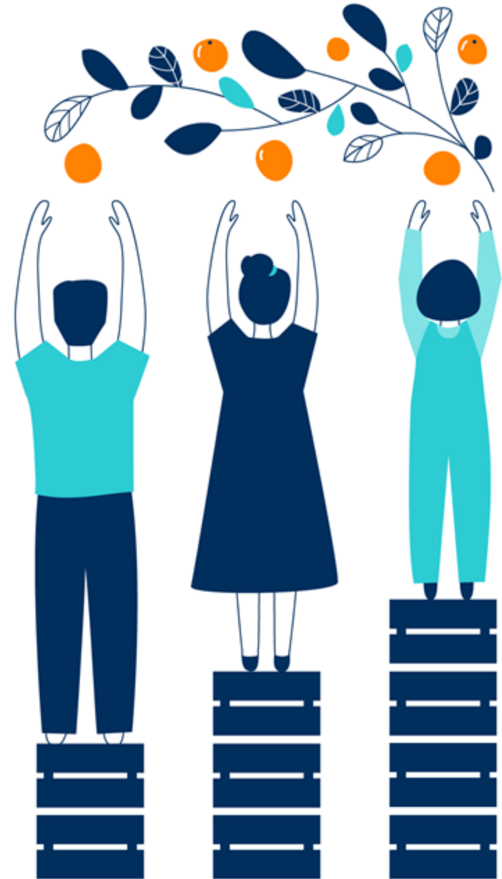
Illustration shows three people (one man, one woman, and one child) standing side by side. All of them stand on differently sized boxes and appear to be at the same closeness to the branch on top which they are trying to reach

An equity approach is needed for gender equality.