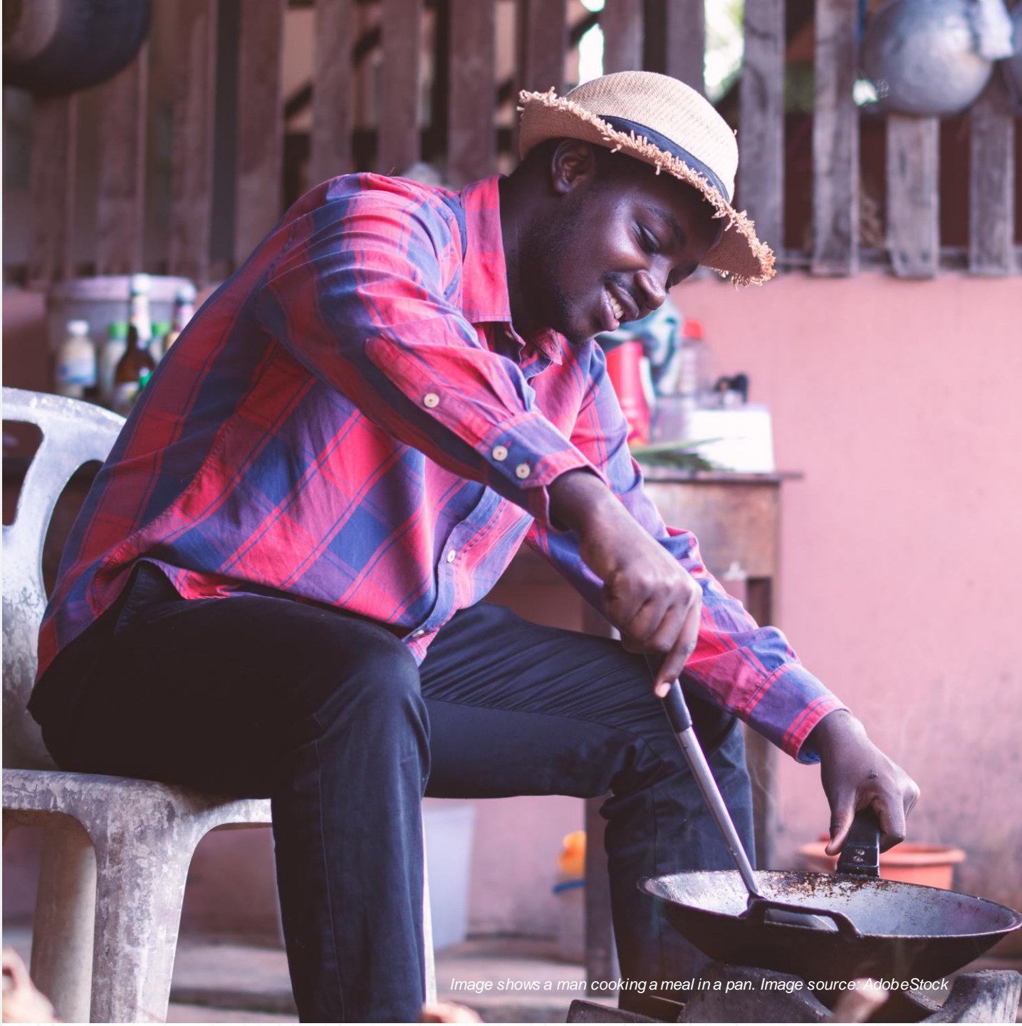
Image shows a man cooking a meal in a pan.