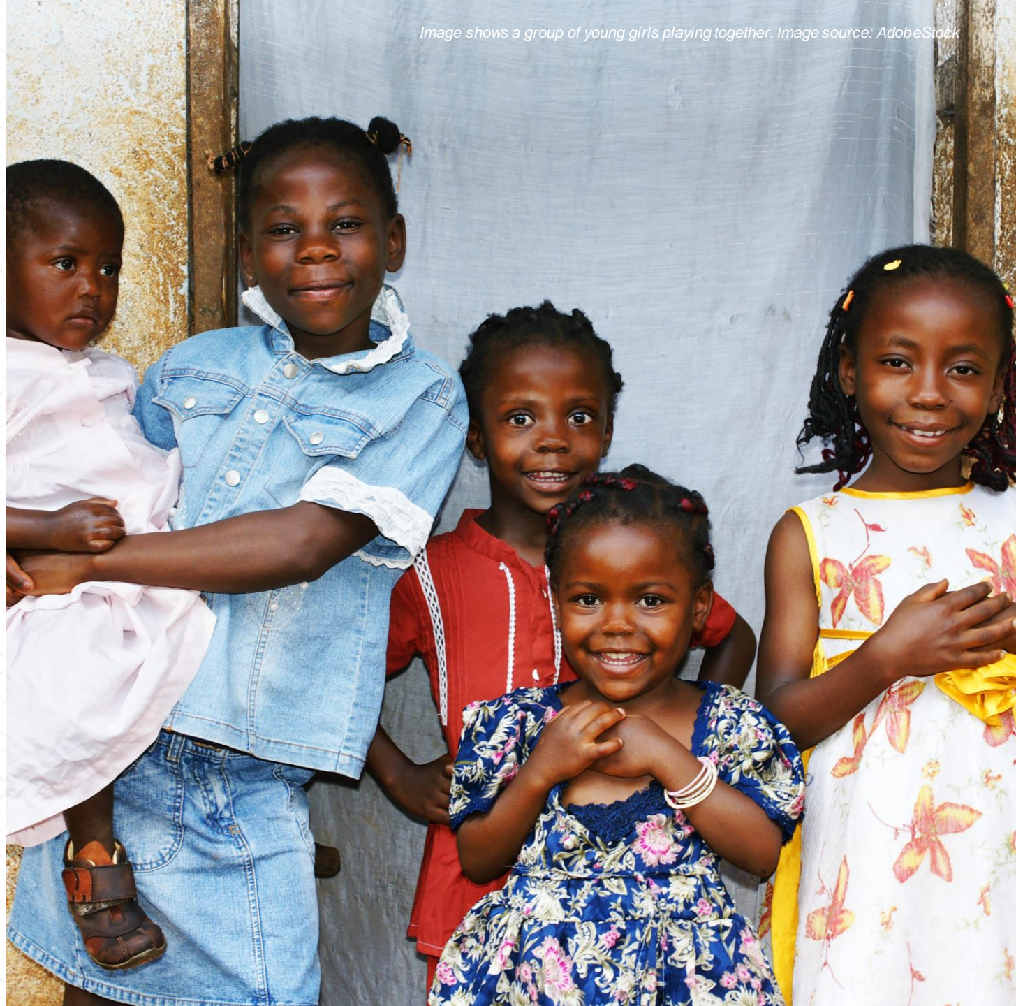
Image shows a group of young girls playing together.

Gender roles are also socially constructed.