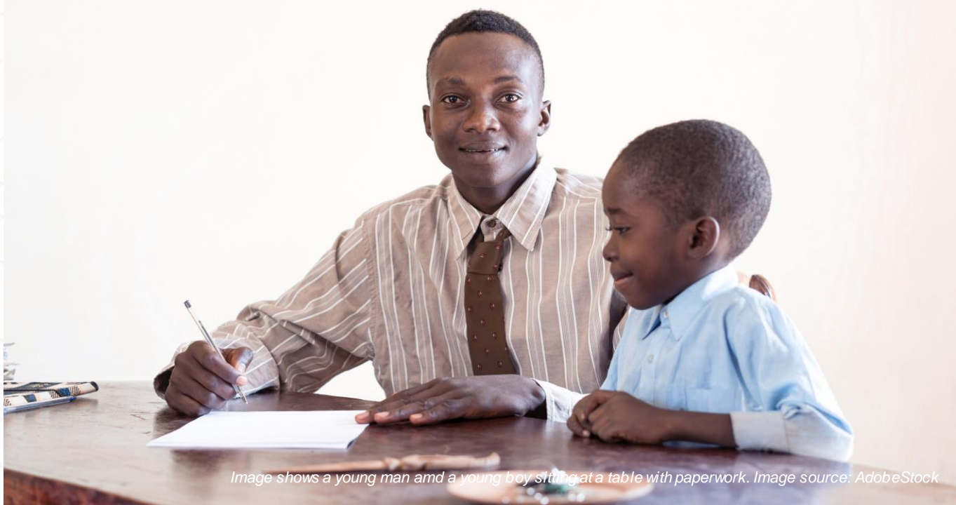
Image shows a young man and a young boy sitting at a table with paperwork.