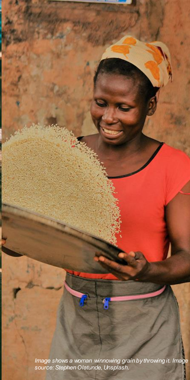
Image shows a woman winnowing grain by throwing it.

Gender refers to cultural attributions (roles, behaviors, etc.) based on sex.