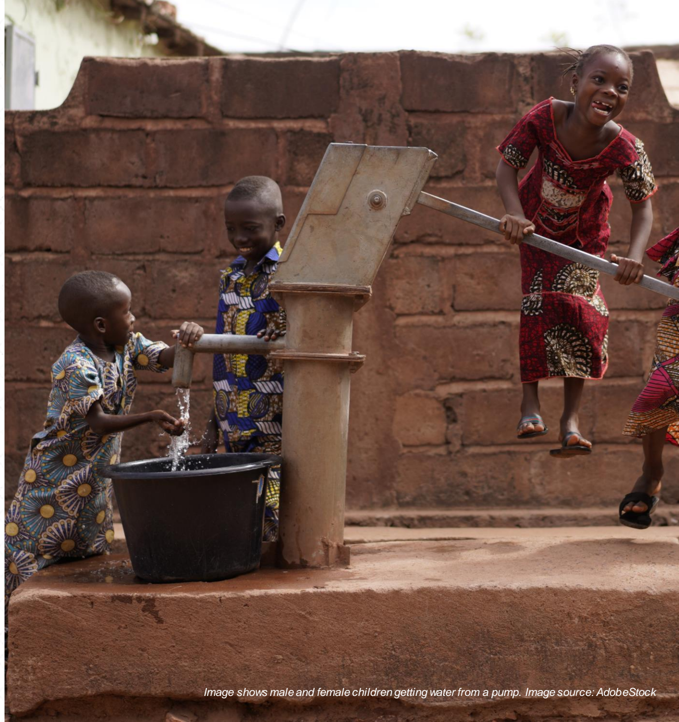
Image shows male and female children getting water from a pump.

Both boys and girls can help around the house in age-appropriate ways.