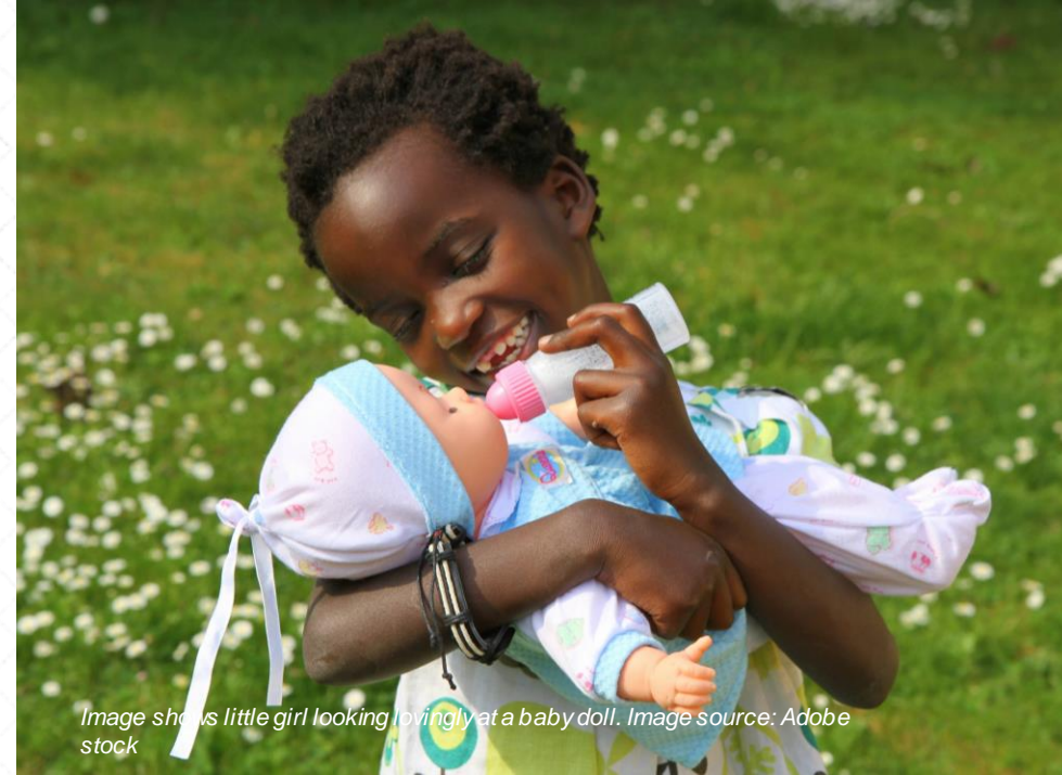
Image shows little girl looking lovingly at a baby doll.