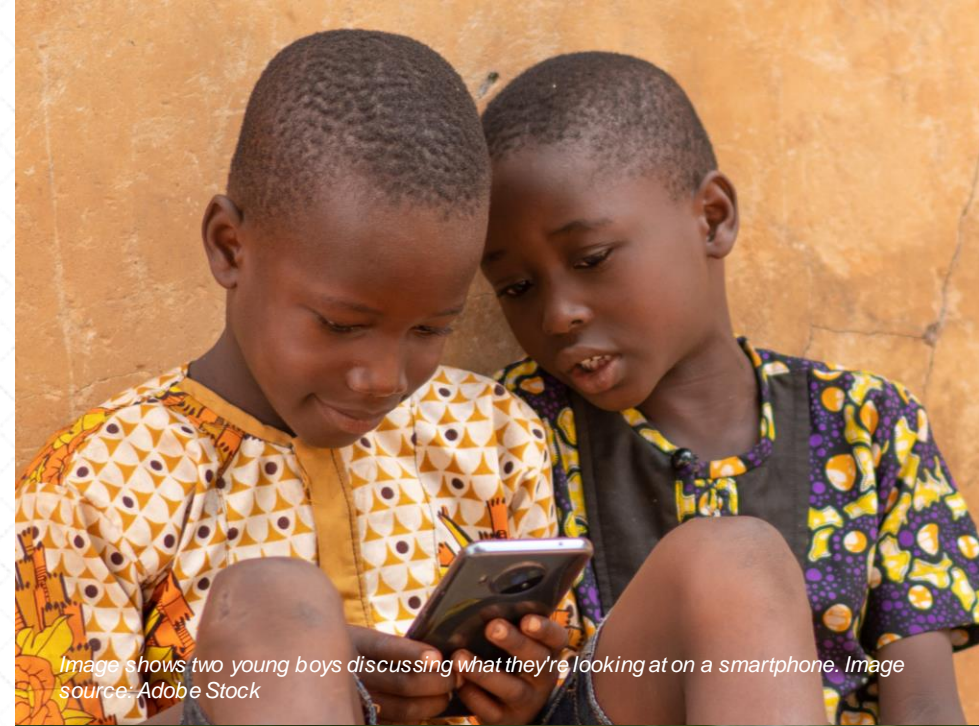
Image shows two young boys discussing what they're looking at on a smartphone.