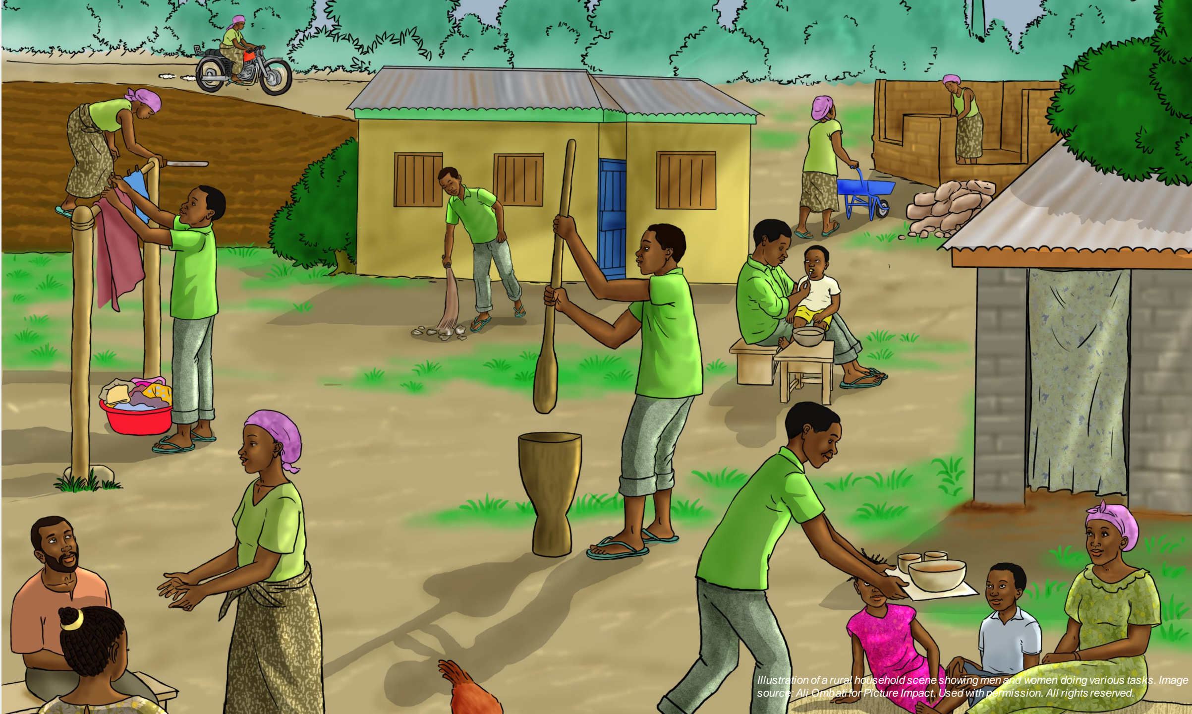
Illustration of a rural household scene showing men and women doing various tasks. Image source: Ali Ombati for Picture Impact. Used with permission. All rights reserved.