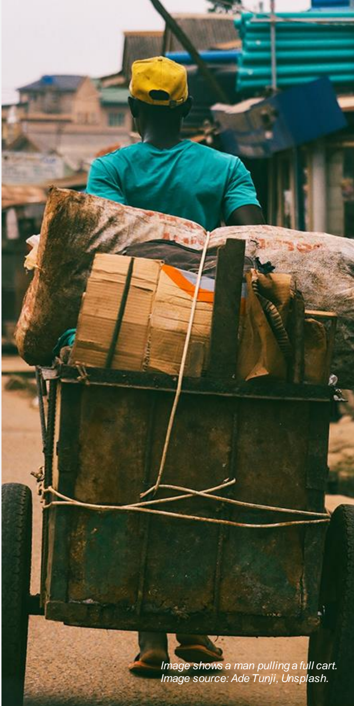
Image shows a man pulling a full cart.