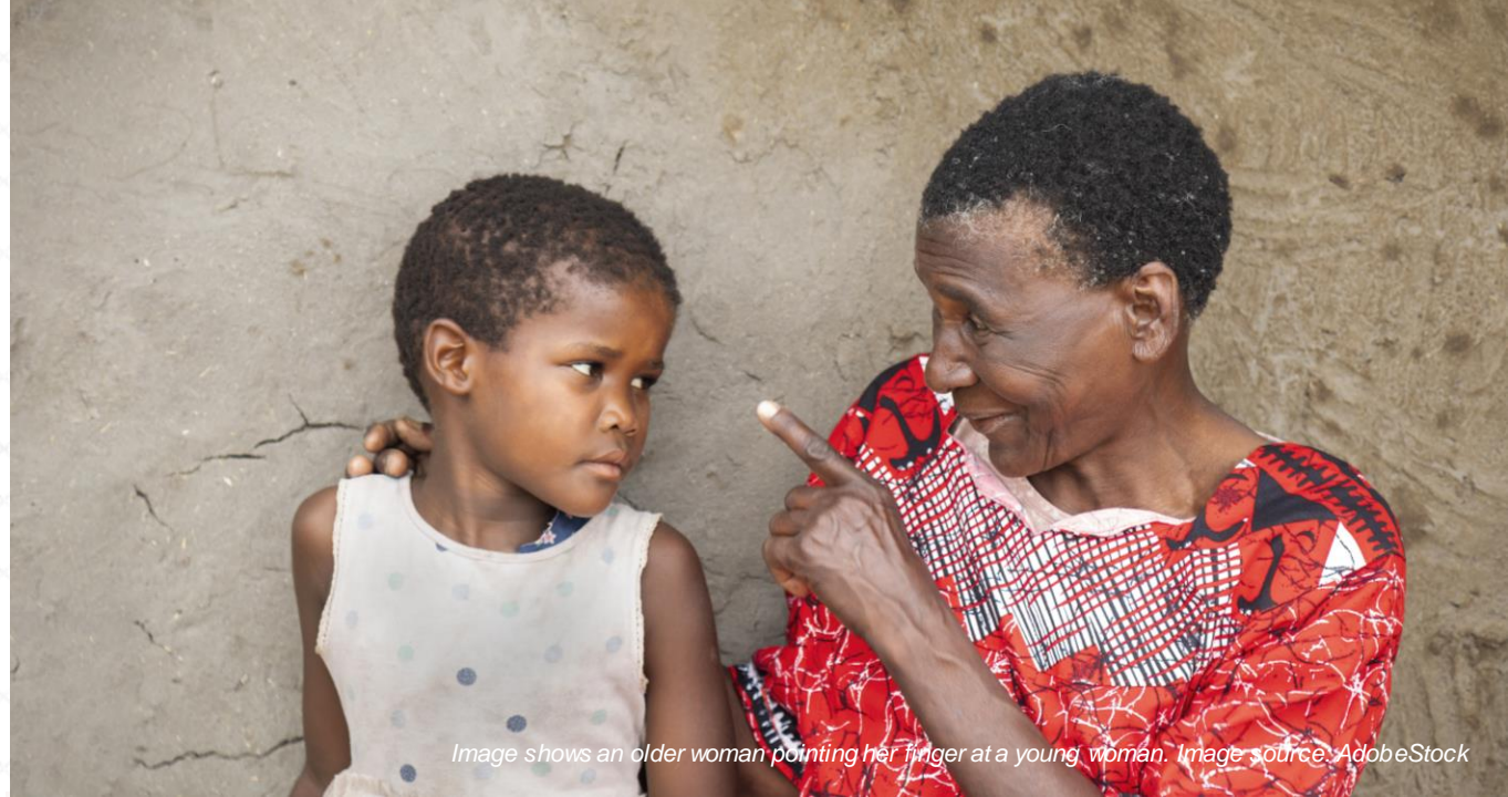
Image shows an older woman pointing her finger at a young woman.

Gender is socialized. It is taught, learned and reinforced throughout our society.