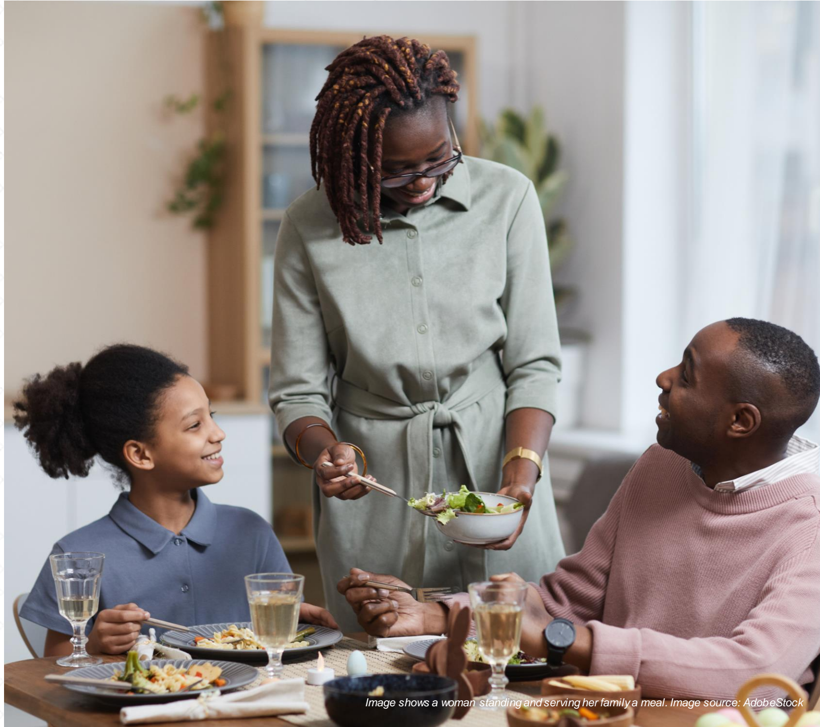
Image shows a woman standing and serving her family a meal.

Strict gender roles limit both women and men .