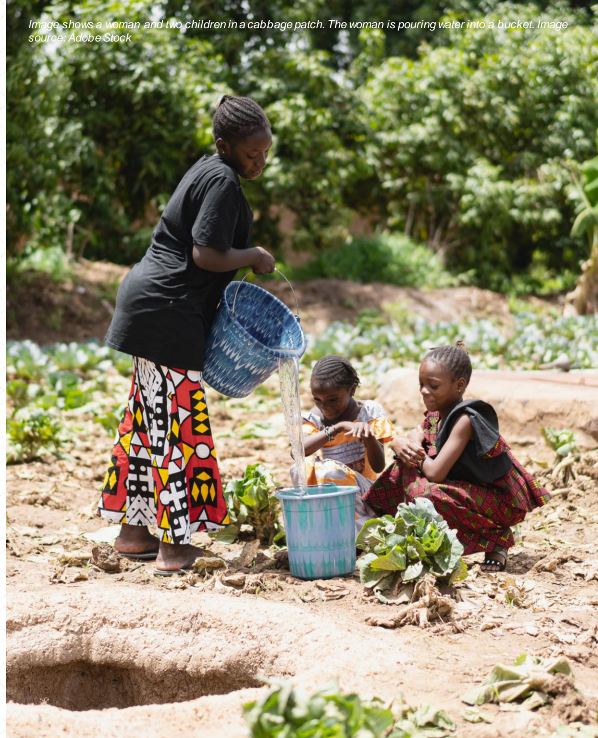
Image shows a woman and two children in a cabbage patch. The woman is pouring water into a bucket.

The amount of time that men and women spend working.