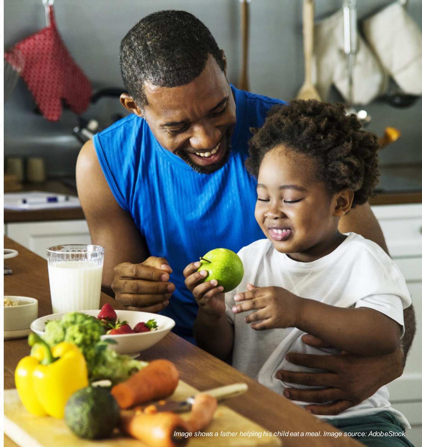
Image shows a father helping his child eat a meal.

Both men and women can be nurturing and are needed in children's lives.