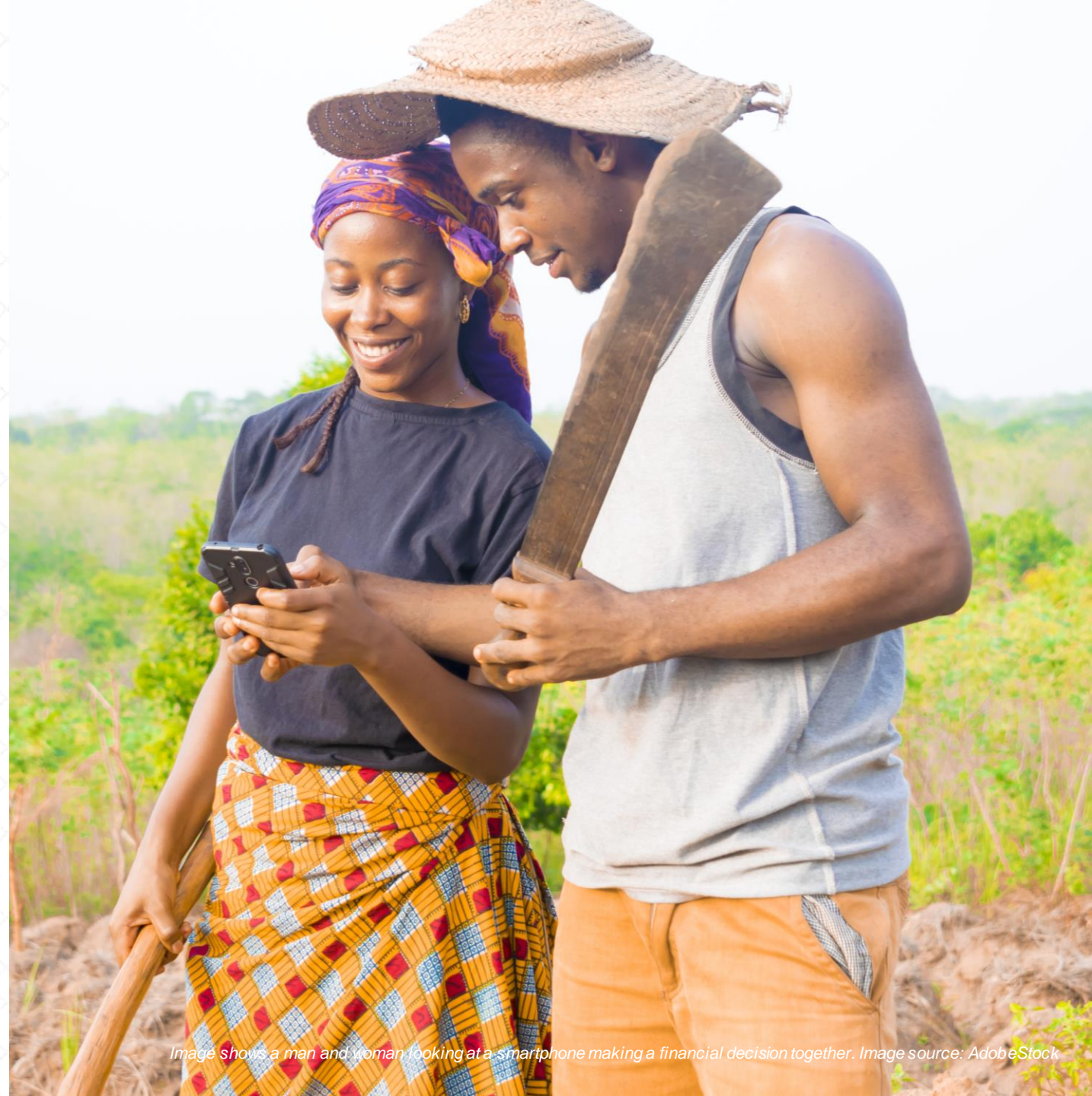
Image shows a man and woman looking at a smartphone making a financial decision together.

Men and women both bring important perspectives to financial decision making and should be involved equally.