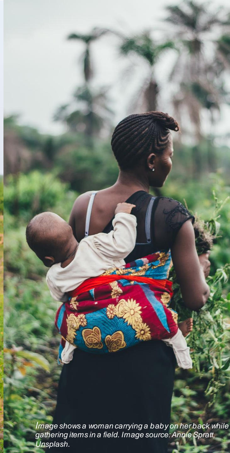
Image shows a woman carrying a baby on her back while gathering items in a field.