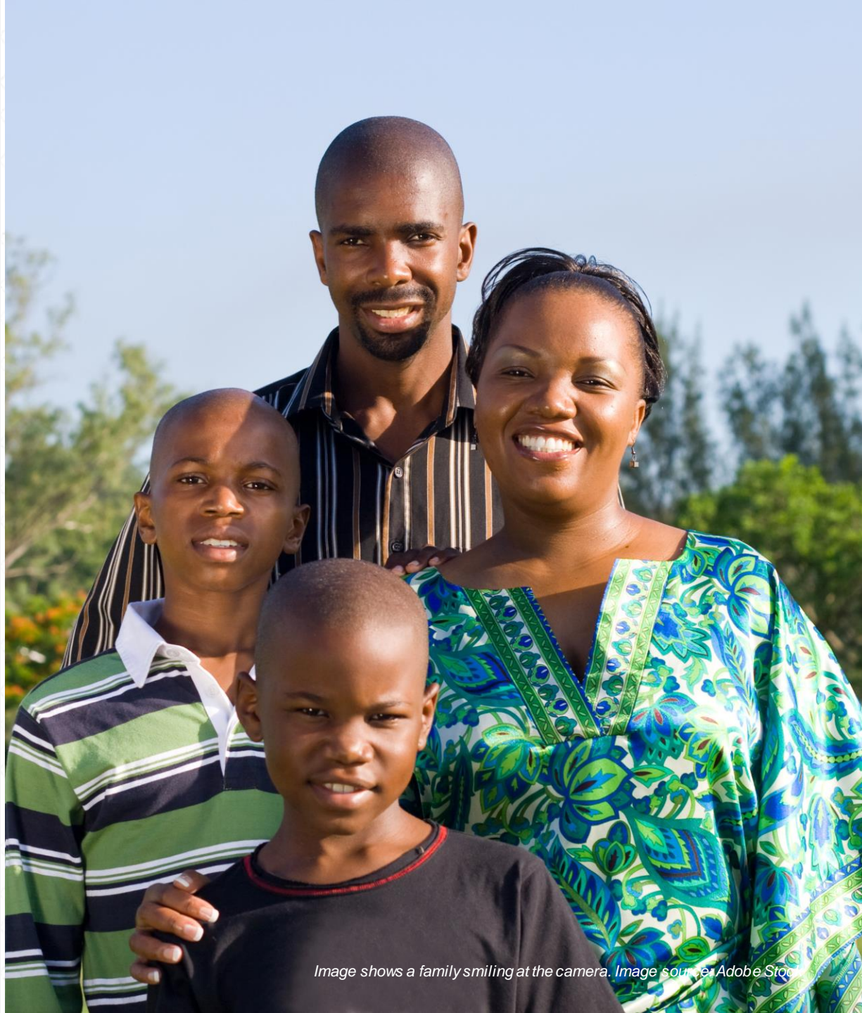
Image shows a family smiling at the camera.