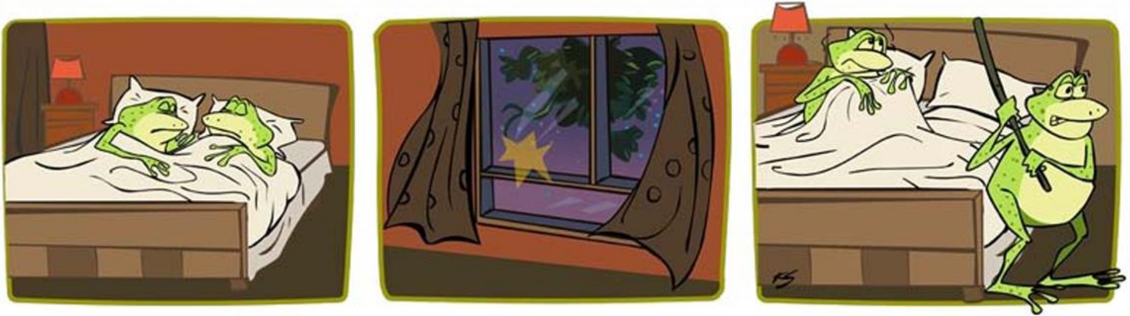
Image shows a cartoon strip with three panes. In the first two frogs are in bed. In the second a window with a dark shape outside and a smashed pane. In the third one frog is out of bed and has a stick in its hands, the other frog is in bed still under the covers but sitting up.