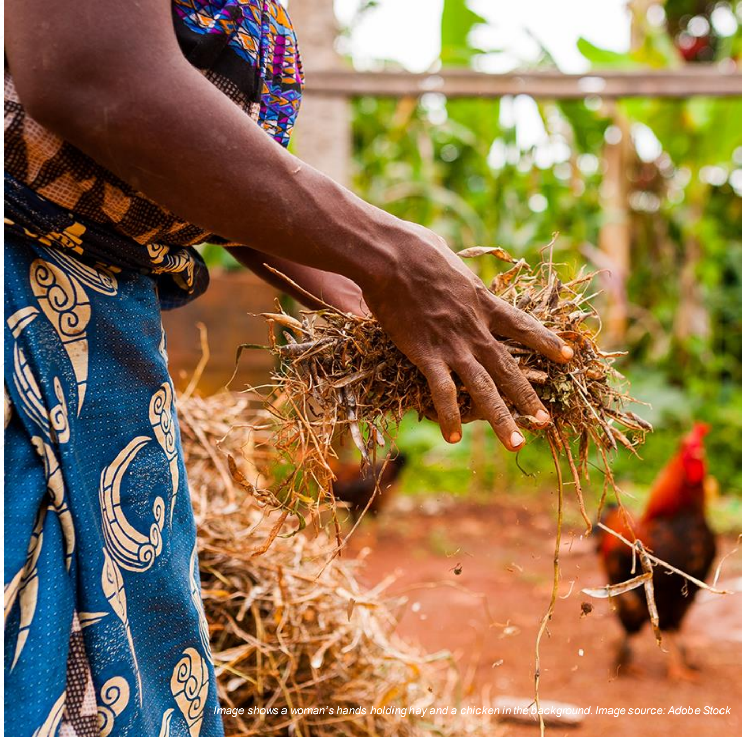
Image shows a woman's hands holding hay and a chicken in the background.

Women's work is often undervalued and underpaid.